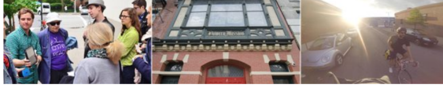
L-R: (1) Cooper Square Committee Tenants' Rights Walking Tour, May 2014, (2) Bowery Mission; (3) City Sensing bike tour