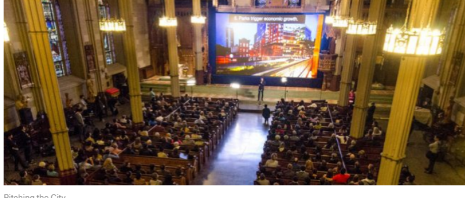
Pitching the City

The rest of the Thursday conference is dedicated to panel discussions, interspersed with screenings of short videos. "Hope and Unrest in the Invisible City" looks at power structures and protest in the public realm, exploring how the disenfranchised find voice and what role art serves in advancing social justice.