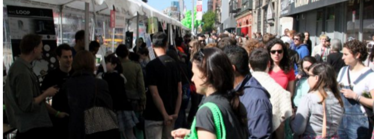
Ideas City 2013

Also on Friday night — in fact, all night Friday night — the festival is hosting "A Performative Conference in Nine Acts," in which "the invisible undercurrents of urban life will come alive through spoken word, dance battles, hot-air balloon performances, and immersive video and sound installations."