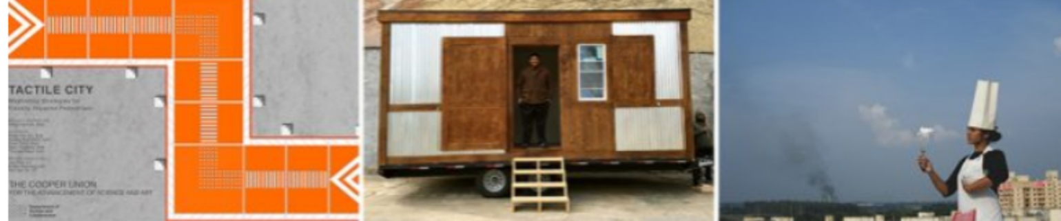
L-R: (1) Wayfinding, courtesy of The Cooper Union School of Architecture 2015; (2) ArtBuilt Mobile Studios; (3) Smog Tasting performance in Bangalore, India, 2011, courtesy of The Center for Genomic Gastronomy

A stretch of food vendors will be available for hungry visitors, but one booth will offer an unusual tasting opportunity: edible smog . The Finnish Cultural Institute, the Center for Genomic Gastronomy, and Edible Geography will serve up "edible smog meringues from different cities and eras," whipping egg foam with air harvested from polluted areas.